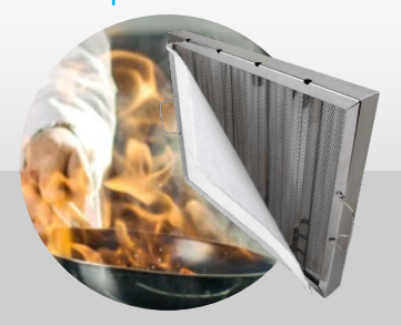
Grease Bloc Filter