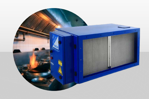
Electrostatic Grease Control

plasma-cleanair.com • ask@plasma-cleanair.com | 0800 652 3325 Earl Business Centre, Dowry Street, Oldham, OL8 2PF